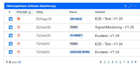
Figure 2: Screenshot Jira

FATIS provides the monitoring of test states and test results, independent from access to test benches – due to the consequent connection to JIRA.