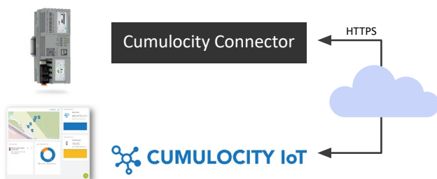
Figure 1: App Concept Overview

The App is available for free in the PLCnext Store . It is easy to install and to configure , so the device integration can be done within minutes. The internal communication of the App and the PLCnext device is done over the RSC protocol .